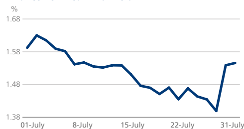
France Ten-Year Mid Yield