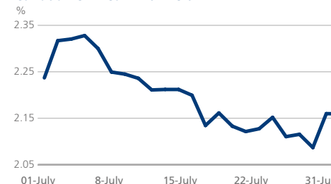
Canada Ten-Year Mid Yield