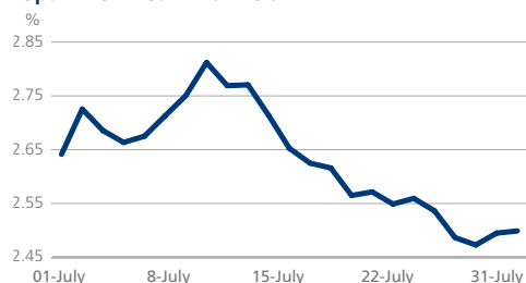
Spain Ten-Year Mid Yield