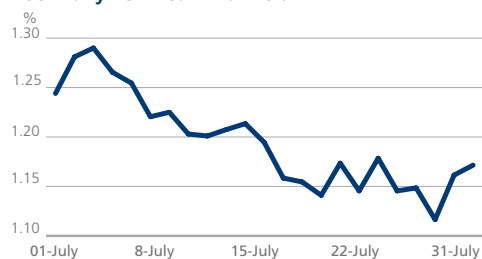
Germany Ten-Year Mid Yield